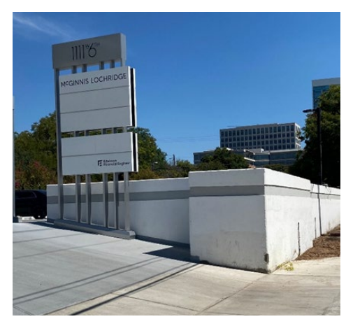
5th Street Entrance